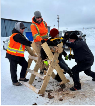
→ Our team enjoying the games

A special shout-out to Horizon North — supplier of workforce accommodations for the Project — for partnering with us to provide hot beverages and treats!