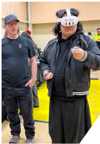
→ A student from NLSS tries virtual reality goggles

We were joined by the International Brotherhood of Electrical Workers (IBEW) and Plan Group. The IBEW trains and certifies electricians, and represents their workers in discussions about wages, hours and working conditions.